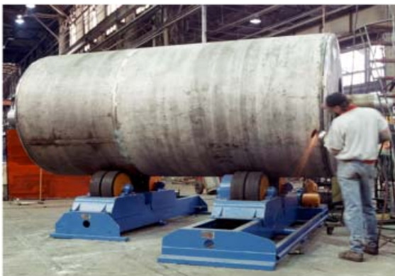
restoration and new fabrication

Contact Buflovak to discuss restoring your drums and optimizing the performance of your dryer or flaker.