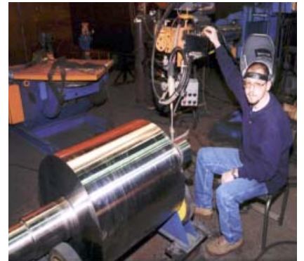
drum surface & trunnion repair